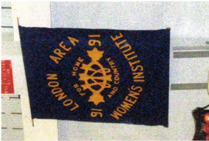
W. I. Ladies wearing blue hats at the London Area Convention held at Mt. Brydges, Saturday, October 4, 2005